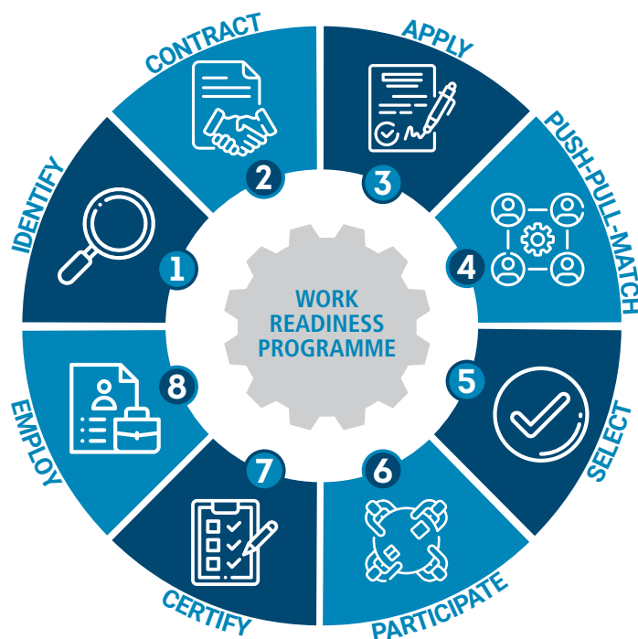
FIGURE 1 - STEPS IN THE WORK READINESS PROGRAMME

The following diagram outlines the critical steps involved in the WRP model, which are described in more detail below.